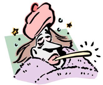
Infection Prevention & Control — The Responsibility Is In Our Hands